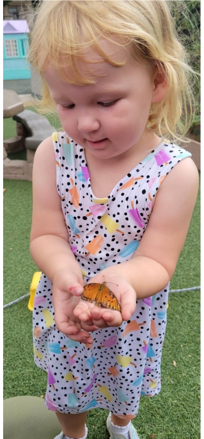
Ready to spray and checking out a Gulf Fritillary butterfly