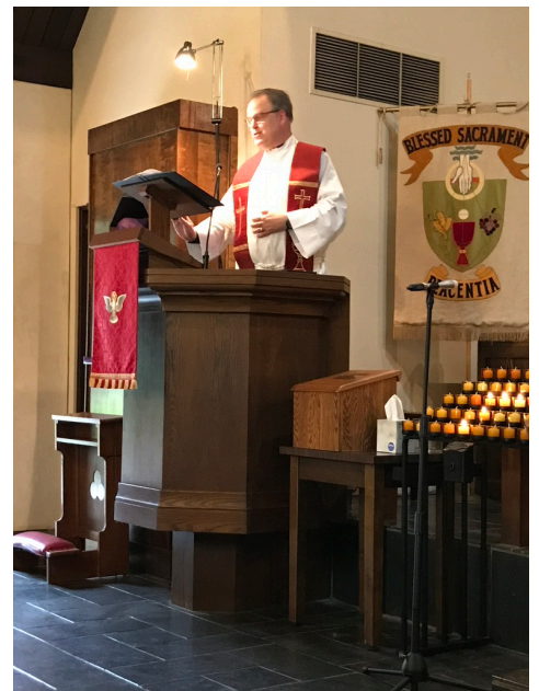
Procession, Offering Plate passed, Palm Sunday sermon and below, Shared Cup Communion!