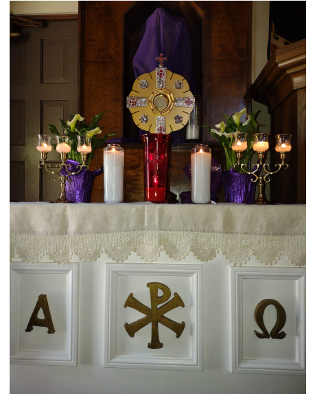
Exhibition of the Monstrance during the Benediction where it is displayed to all present as we receive it's blessings coming from Christ Himself.