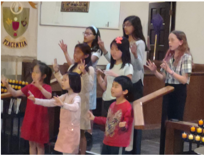
California Children's Choir