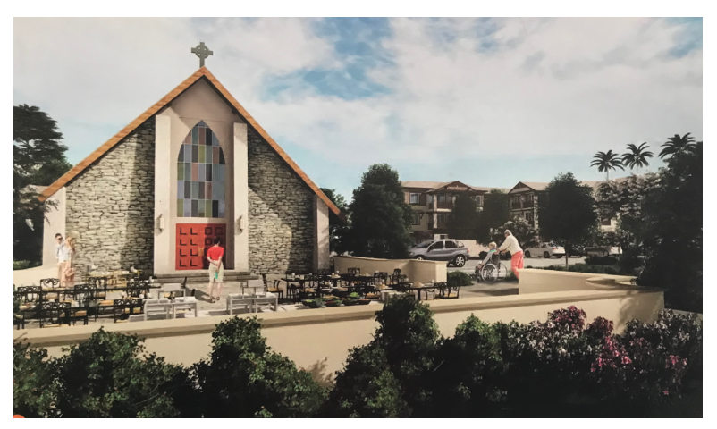
South Residential Complex to be located back of parking lot bordering Morse Ave.

June 26,2022 Requiem & Celebration of our new Ministry. We will be having a special liturgy between services from 9:15 AM-10:15AM to say goodbye and share fond memories around the buildings to be demolished, and then welcoming what God is doing now with the new ministry of Santa Angelina.