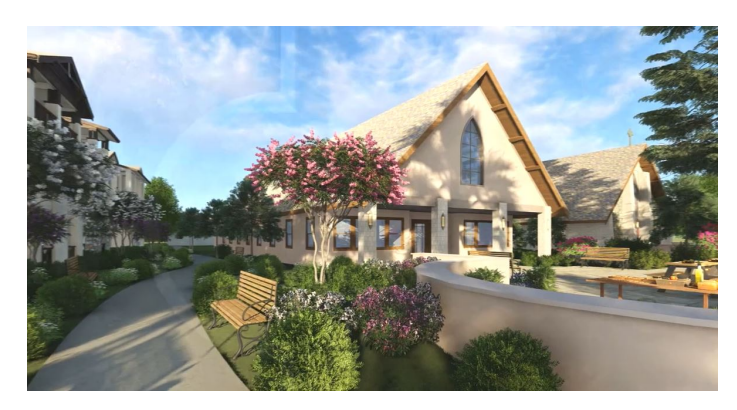
North side with housing on the left and the new Parish Hall in the center and Church on the right

Here are some conceptual drawings (not final), but a good idea of the final presentation.