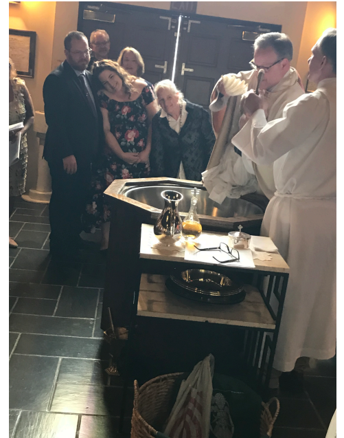
Left to right: Presentation and prayers; Blessing of the Water; Baptism