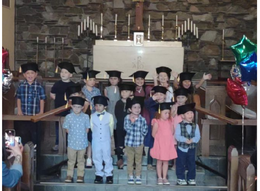
Graduation 2023, June 4, 2023