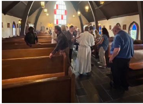
The Peace is shared...