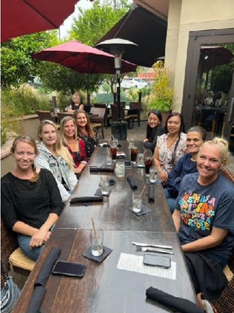
Teacher Appreciation Day, June 9, 2023

The Blessed Sacrament Children's Learning Center has celebrated both Graduation and Teacher Appreciation Day. Aren't those kids the cutest graduates you've ever seen?