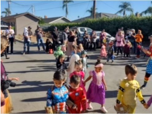
The big parade underway. Many cute costumes, happy parents and staff taking part.