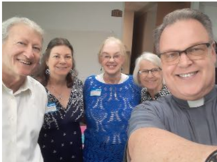
Part of our Blessed Sacrament team! Thanks be to God for all!