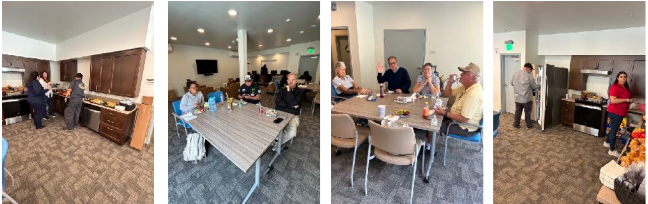
Food and drink were provided before and after, thank you! Great fellowship with over 6-8 hours of work.